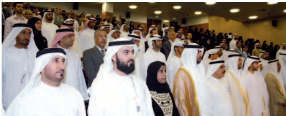
UAE University and Al Ain Municipality officials attending the Opening Ceremony of the First International Conference on Engineering Geophysics.

In addition to the main engineering and geotechnical objectives of the coming event, it has been decided to include special sessions of other related applications of engineering geophysics