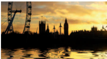
London's famous skyline.

This year London will host EAGE's Annual Meeting for the fourth time when the 75 th EAGE Conference & Exhibition incorporating SPE EUROPEC 2013 (10–13 June 2013) comes to town. It is worth booking early for early bird registration deals and more.