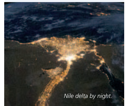
Nile delta by night.

Estimated reserves for Balsam-1 are between 76 to 436 bcf of gas with between 2.5 and 9.4 million barrels of condensate (mmbo). The estimated reserves for the Alyam-1 discovery are between 8–66 bcf and between 0.2–1.3 mmbo.