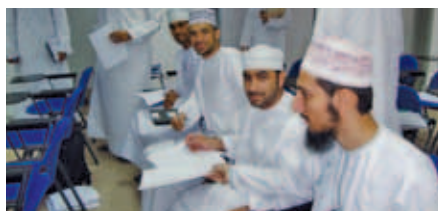
Students ready for the lecture.

The course proved useful for both undergraduate as well as graduate students. An overview of the