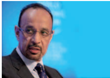
Khalid al-Falih, chief executive, Saudi Aramco

Meantime Saudi Aramco chief executive Khalid al-Falih recently confirmed plans to drill seven gas exploration wells in deep and shallow water in the Red Sea, off the coast of the northwestern city of Tabuk. In addition Saudi Aramco will start gas production this year at its Midyan field in Tabuk, which was discovered in the 1980s.