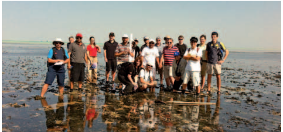
Field trip participants enjoying the Abu Dhabi Sabkha.